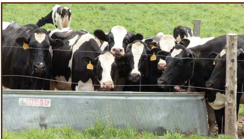
Water troughs provide a moist, nutrient-rich environment for bacterial survival, including the bacteria known to cause Johne's disease.

To inhibit the spread of MAP and exposure of susceptible animals to MAP on infected farms, best management practices aimed at maintaining biofilm-free trough surfaces should be included in any Johne's disease control plan.