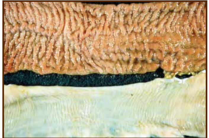
Top ileum: Inflammatory response to MAP.

along with other factors, the infected animal cannot absorb the nutrition it needs and thus begins to lose body condition, milk production drops off and diarrhea may occur. In effect, an animal with Johne's disease is starving in spite of having a good appetite and eating well.