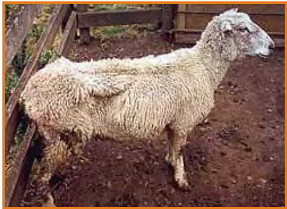
A sheep showing symptoms of Johne's disease.

Since the signs of Johne's disease are similar to those for several other diseases—parasitism, dental disease and caseous lymphadenitis (CLA), laboratory tests are needed to confirm a diagnosis.